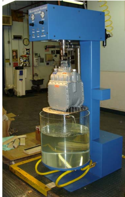
Con Edison WLT-800 Installation